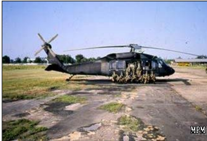
Typical UH-60 Interdiction Aircraft with Response Team