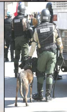
Civil Disorder/Riot Control & Tactics