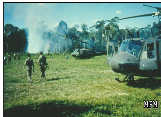
Law Enforcement Operations from FOB