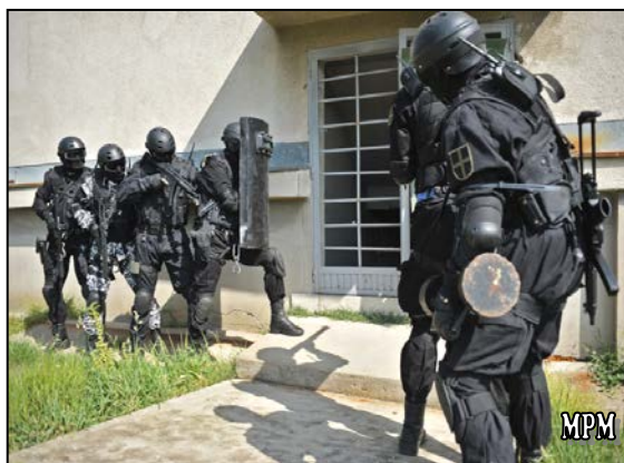
↑ Breaching Techniques • Mobile Road Interdiction ↓