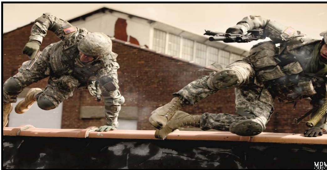
Tactical Training & Movement