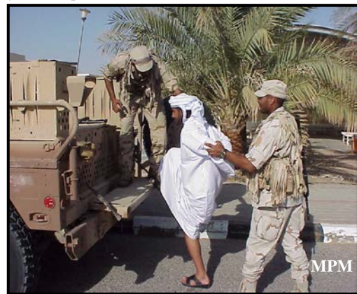
Arrest & Prisoner Transport Techniques

After considering the quantity and inherent training difficulties of the various components selected, each will be fused with the existing MPM training disciplines thereby determining the length and complexity of the client's individual security program training cycle.