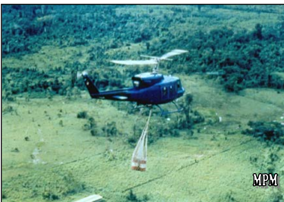
Sling-Loading to Forward Operating Base ("FOB")