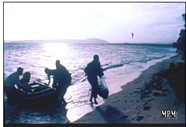
Tactical Beach Insertions