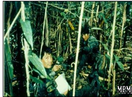
Patrolling & Land Navigation Training

needs evolve, or attrition necessitates additional, albeit unexpected, training for new personnel, the client's in-house personnel will be in a position to take the lead role in such training. Cost savings and training continuity aside, such a program (3T) has been found to be extremely effective in developing individual self-esteem, employee morale, as well as strengthening individual employee allegiance to the local police/security management team thus, offering an immediate benefit to the client and their operational effectiveness.