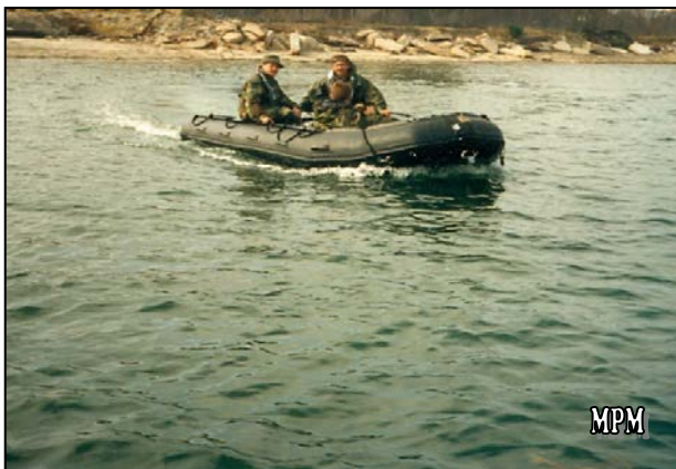
Zodiac Operations from FOB