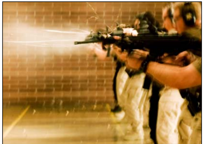
Outdoor/Indoor Tactical Range Gear