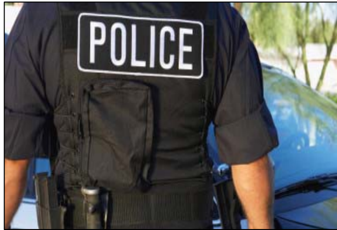
Tactical Street Attire