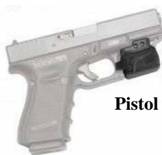
Pistol Laser Sight