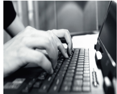
Mobile & Static Computer Equipment