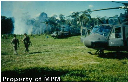
Property of MPM