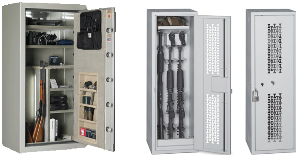
Secure Weapons/Ammunition Lockers (All Sizes)