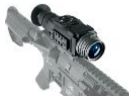
Rifle Mounted NVG Scopes