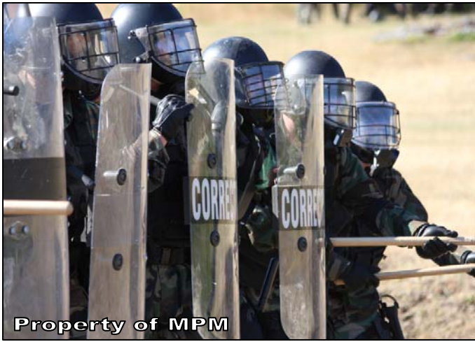
Property of MPM