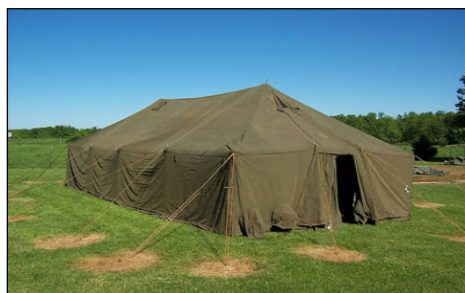
GP Utility Tents