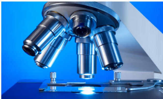
Forensic/Evidence Collection Supplies & Related Equipment