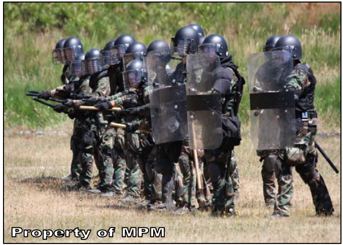
Property of MPM