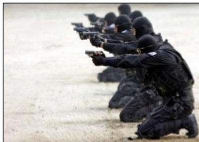
Firearms Training Equipment