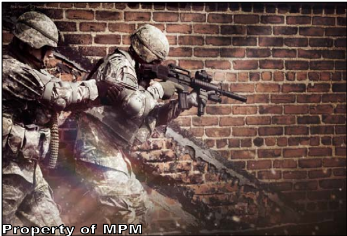
Property of MPM