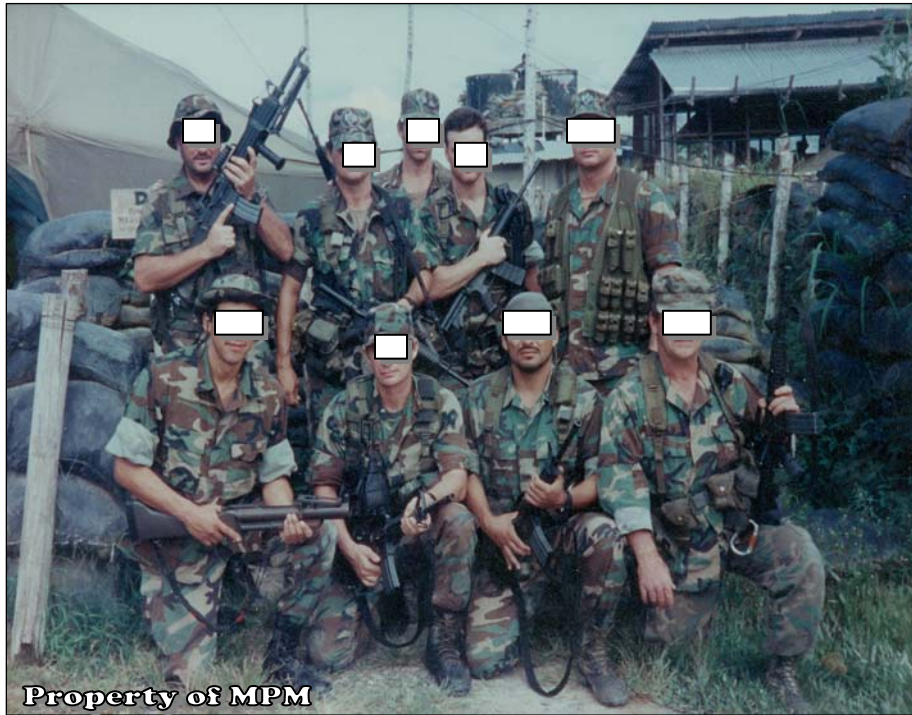
US Foreign Counter-Narcotics Operations