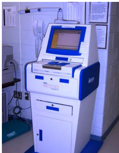
Digital Fingerprint Scanners