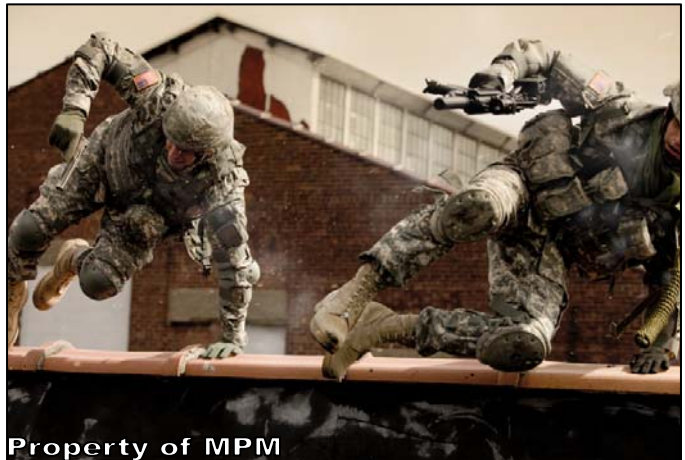
Property of MPM