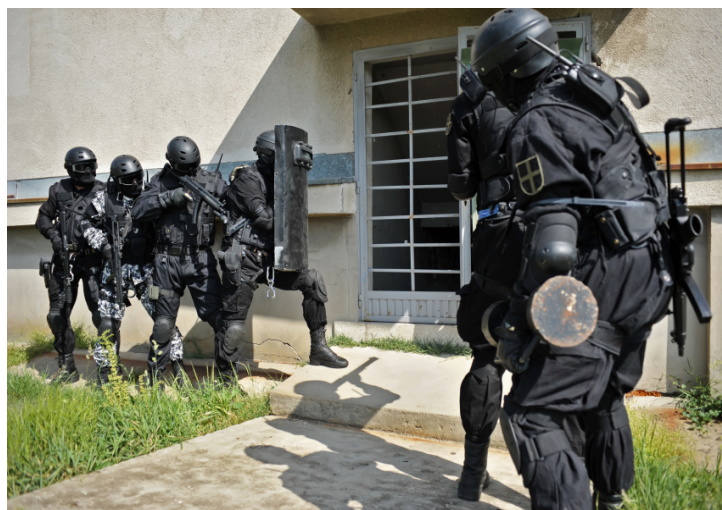
Breaching Uniforms & Equipment