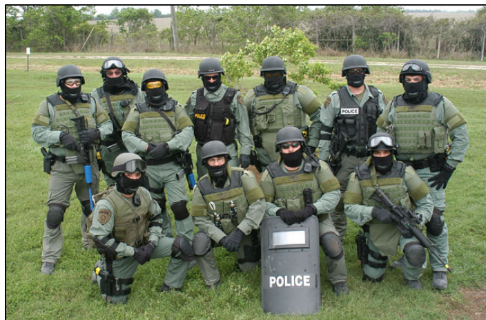
SWAT Team Equipment