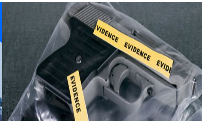
Secure Drug/Evidence Bags